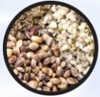
Hemp Seed Oil