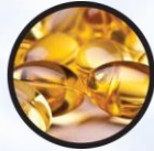
Vitamins A, B, and C